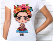
Vibrant Color Prints