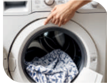
Superior Wash & Rub Fastness