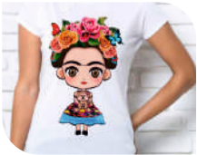
Vibrant Color Prints