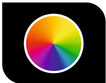
OEM Matching Colors