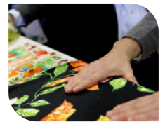
Minimal Hand Feel