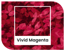
Enhanced Color Gamut