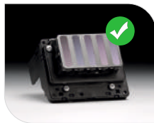
Reliable Printhead Performance