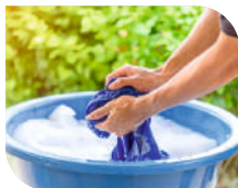
Excellent Wash Fastness