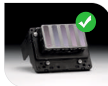
Nozzle & Printhead Reliability