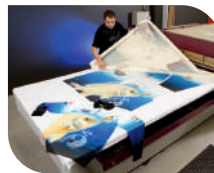
Vibrant Color Transfers