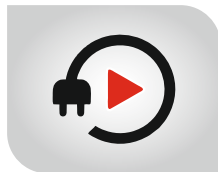
Reliable Plug & Play Solution