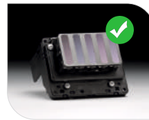
Reliable Printhead Performance