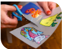
Brilliant Color Performance