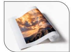
Excellent Adhesion to Media