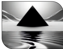
Improved Black Density