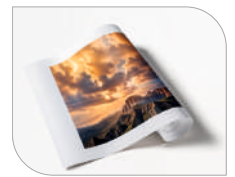
Fast Drying Inks