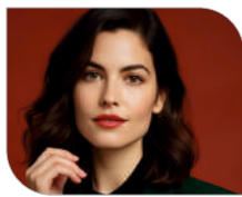
Accurate Skin Tones