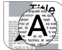
Excellent Print Sharpness