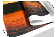
Wide Media Compatibility