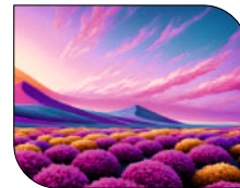
Detailed Tonal Gradation