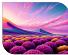
Smooth Color Gradation