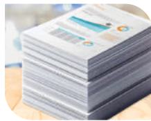
High Yield Ink Packs