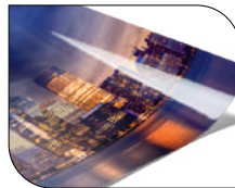
Superior Gloss Uniformity