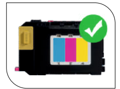
Reliable Printhead Performance